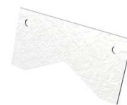
Spazzer® Bar Guard™