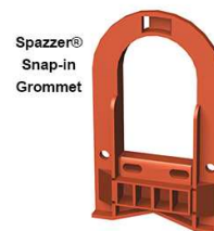
Spazzer® Snap-In Grommet