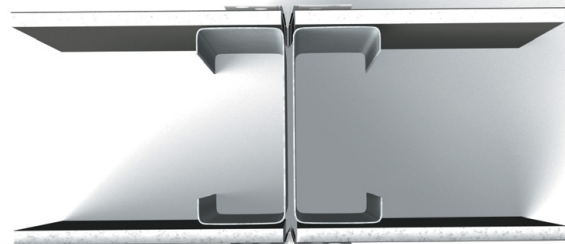
1 Hour Fire Rating (1) 5/8" Type "X" Drywall on each side