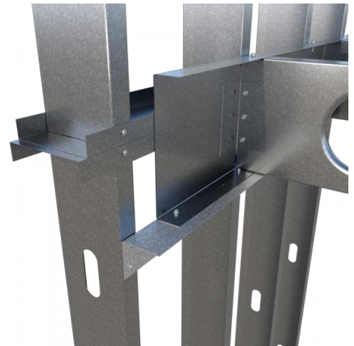
Structural Framing - Ledger Support