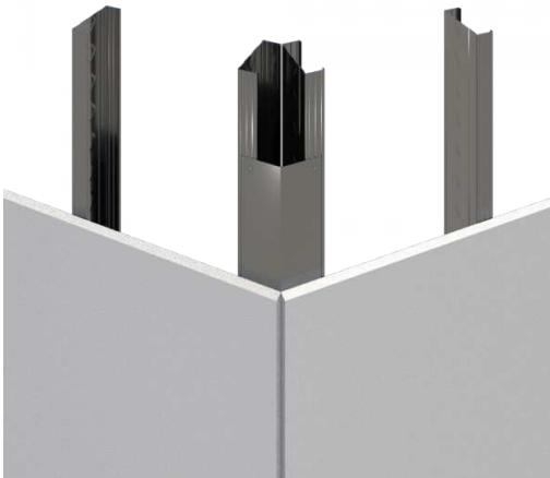
Drywall Framing - 120° / 135° Degree Corner