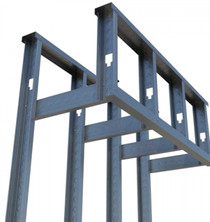
Drywall Framing - Bulkhead Leading Edge