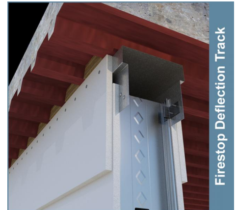
Firestop Deflection Track