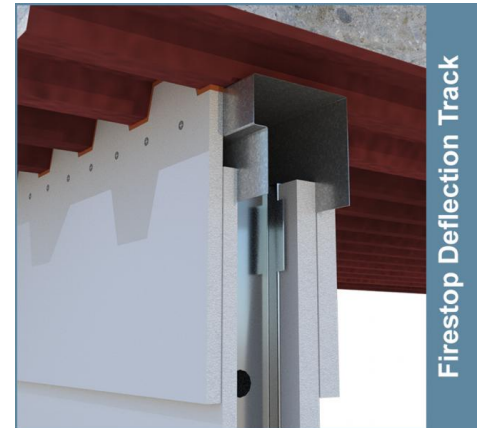
Firestop Deflection Track