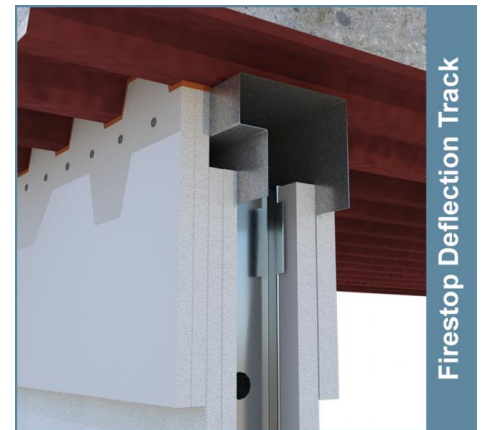
Firestop Deflection Track