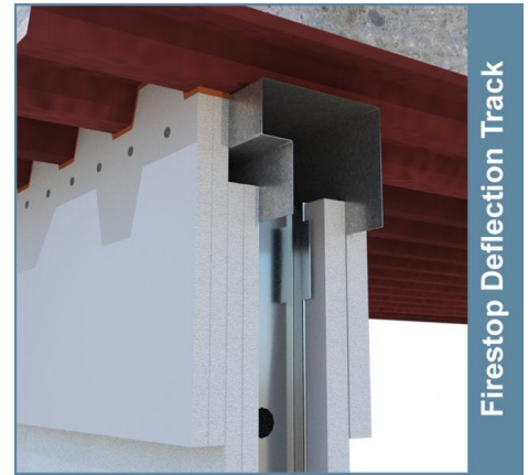
Firestop Deflection Track