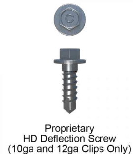
Proprietary HD Deflection Screw (10ga and 12ga Clips Only)

*** FUS clip can be installed as a rigid connection only OR deflection connection only ***