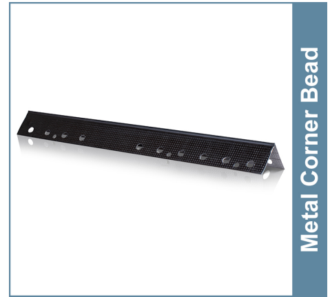
Metal Corner Bead