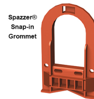
Spazzer® Snap-In Grommet