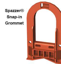
Spazzer® Snap-in Grommet