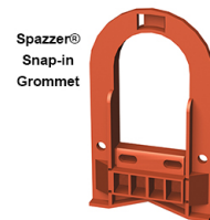
Spazzer® Snap-in Grommet