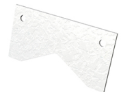
Spazzer® Bar Guard™