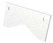
Spazzer® Bar Guard™