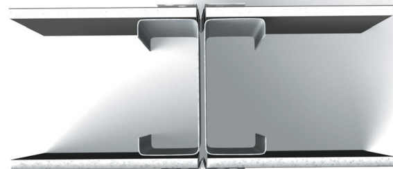
1 Hour Fire Rating (1) 5/8" Type "X" Drywall on each side