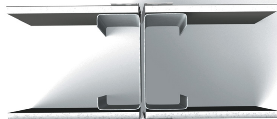
1 Hour Fire Rating (1) 5/8" Type "X" Drywall on each side