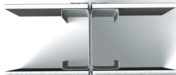
1 Hour Fire Rating (1) 5/8" Type "X" Drywall on each side