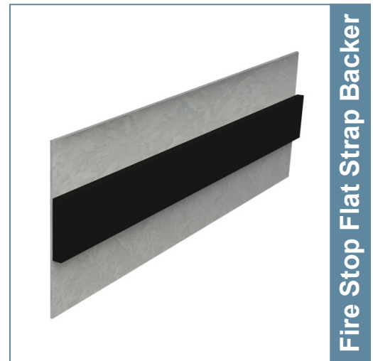
Fire Stop Flat Strap Backer