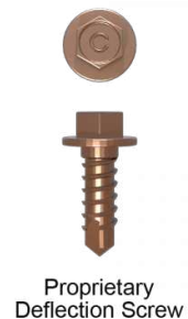
Proprietary Deflection Screw