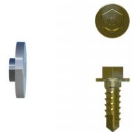
FastClip Deflection Screw Silver Bushing is for 12ga Clip