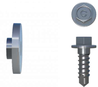
Proprietary HD Deflection Screw (10ga and 12ga Clips Only)