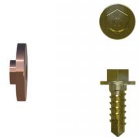
FastClip Deflection Screw Copper Bushing is for 14ga Clip