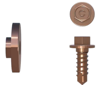
Proprietary Deflection Screw