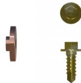
FastClip Deflection Screw Copper Bushing is for 14ga Clip